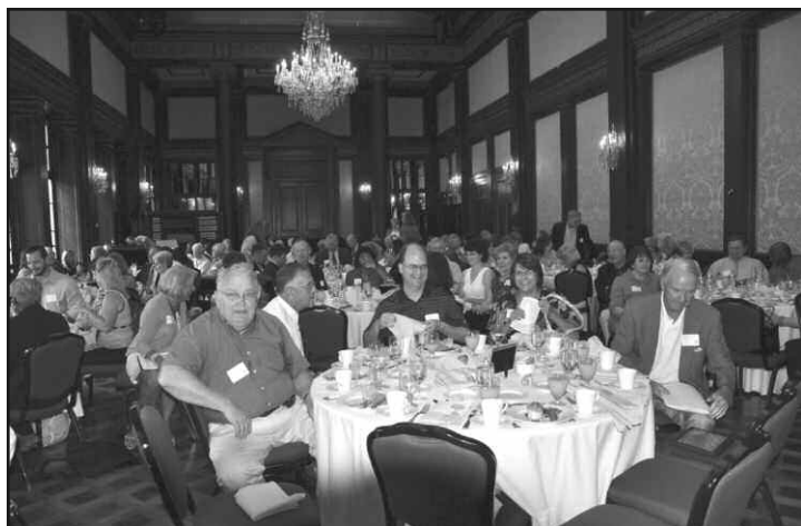
Attendees enjoy breakfast in Longwood Garden's ballroom.